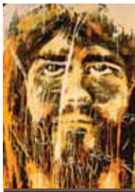
The Splat Experience