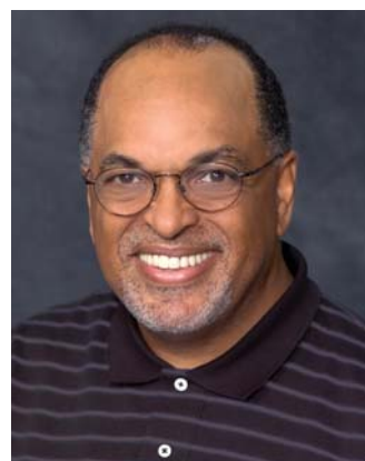
Crawford Loritts Legacy